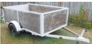
Utility Trailer 5ft W x 8ft $350.00 or best offer. 503-861-1724