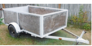
Utility Trailer 5Ft W x 8Ft $350.00 or best offer. 503-861-1724

If you want results... 74% of Clatsop County Residents read The Daily Astorian and rated Classifieds #1 for the most read section!! (From 2010 Astoria Market Study, by Marshall Marketing & Communications, Inc. Pittsburgh, PA) (503)325-3211 ext. 231 or (800)781-3211 classifieds@dailyastorian.com www.dailyastorian.com