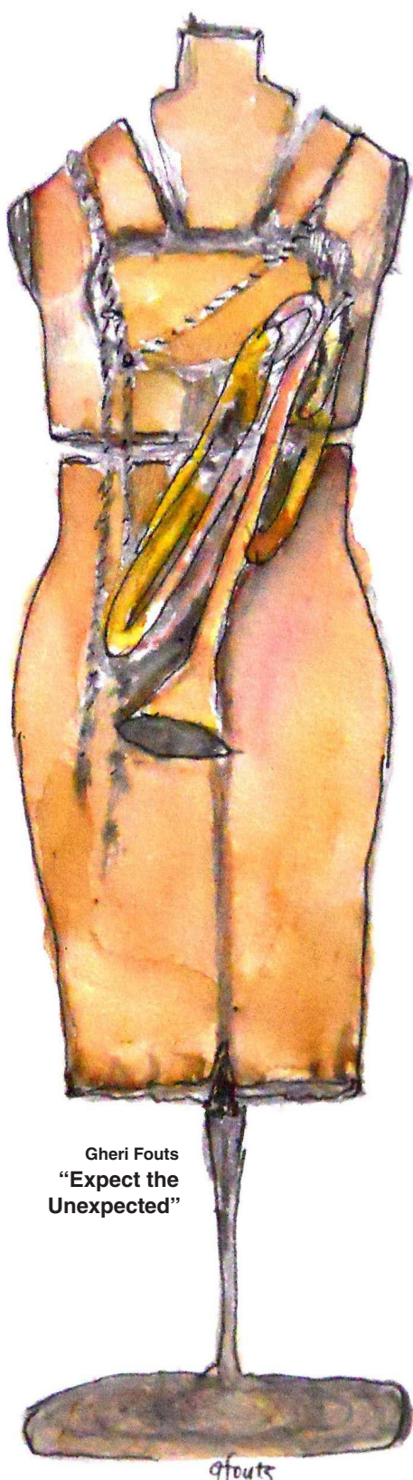
Gheri Fouts “Expect the Unexpected”