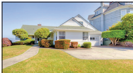
1608 Irving Avenue, Astoria • $849,000

Located in the gated community of Pacific Bellevue, this 4 bedroom, 3 bathroom home features a spacious master suite with fireplace sitting room, formal living and dining, inspired chef's kitchen and decks to take in the views.