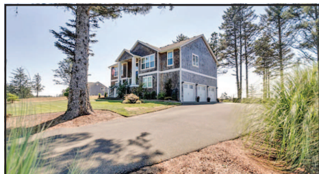
90822 Kennedy Road, Warrenton • $589,000

This Columbia River view, Ben Johnson custom home is situated on a private, estate-sized lot with a beautifully-appointed yard & garden area, flower beds, vegetable gardens, exquisite fruit trees & conifers, fenced for privacy. Every inch of the interior and exterior of this exceptional home reflects an artist's influence and aesthetic and will captivate.