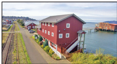
396 31st Street, Astoria • $989,000

Experience the dream of waterfront living in historic Astoria at its finest. This 3 bedroom, 2 bathroom Columbia Riverfront home was custom designed & built for its owner by craftsman Rich Elstrom. Two levels feature the finest finish detail, including an open upper level floor plan with tall ceilings & walls of windows.