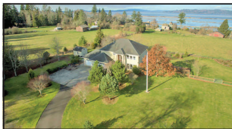
92745 Sunrise Drive, Astoria • $469,950

Experience the dream of waterfront living in historic Astoria at its finest. This 3 bedroom, 2 bathroom Columbia Riverfront home was custom designed & built for its owner by craftsman Rich Elstrom. Two levels feature the finest finish detail, including an open upper level floor plan with tall ceilings & walls of windows.