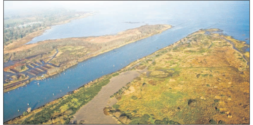
The Port Commission on Tuesday voted to relinquish its lease of more than 90 acres on the eastern side of the Skipanon Peninsula from the Department of State Lands.