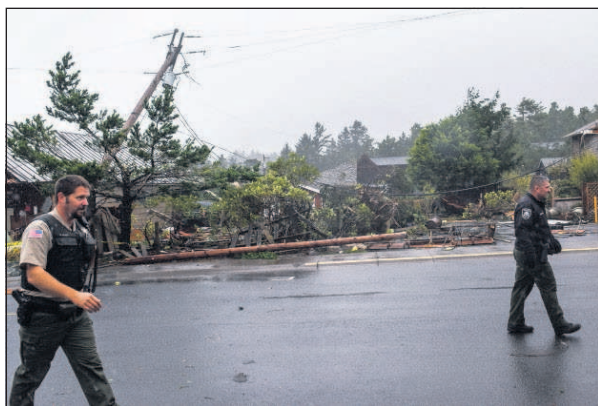
Officers walk past storm damage that can be seen along Laneda Avenue on Friday morning in Manzanita.