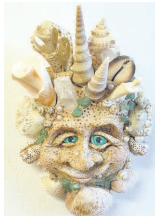
SUBMITTED PHOTO A Sea Sprite sculpture by Jill Trenholm.

Bay Avenue Gallery is located at 1406 Bay Ave. For more information, call the gallery at 360-665-5200 or visit bayavenuegallery.com