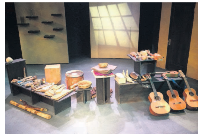
Grupo Condor uses Spanish string instruments, American flutes, and both African and American percussion.