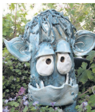
SUBMITTED PHOTO A Garden Guardian by Sue Raymond.