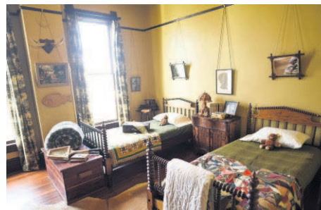
A bedroom in the Foard home, which will be featured on Assistance League of the Columbia Pacific's annual Home & Chef Tour on Oct. 15 in Astoria.