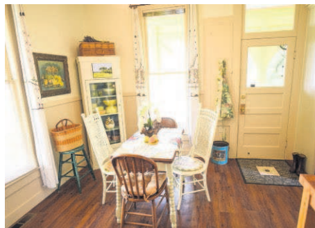
At the rear of the Foard home is a modern kitchen with an original, built-in china closet and outside door that leads to the back porch.