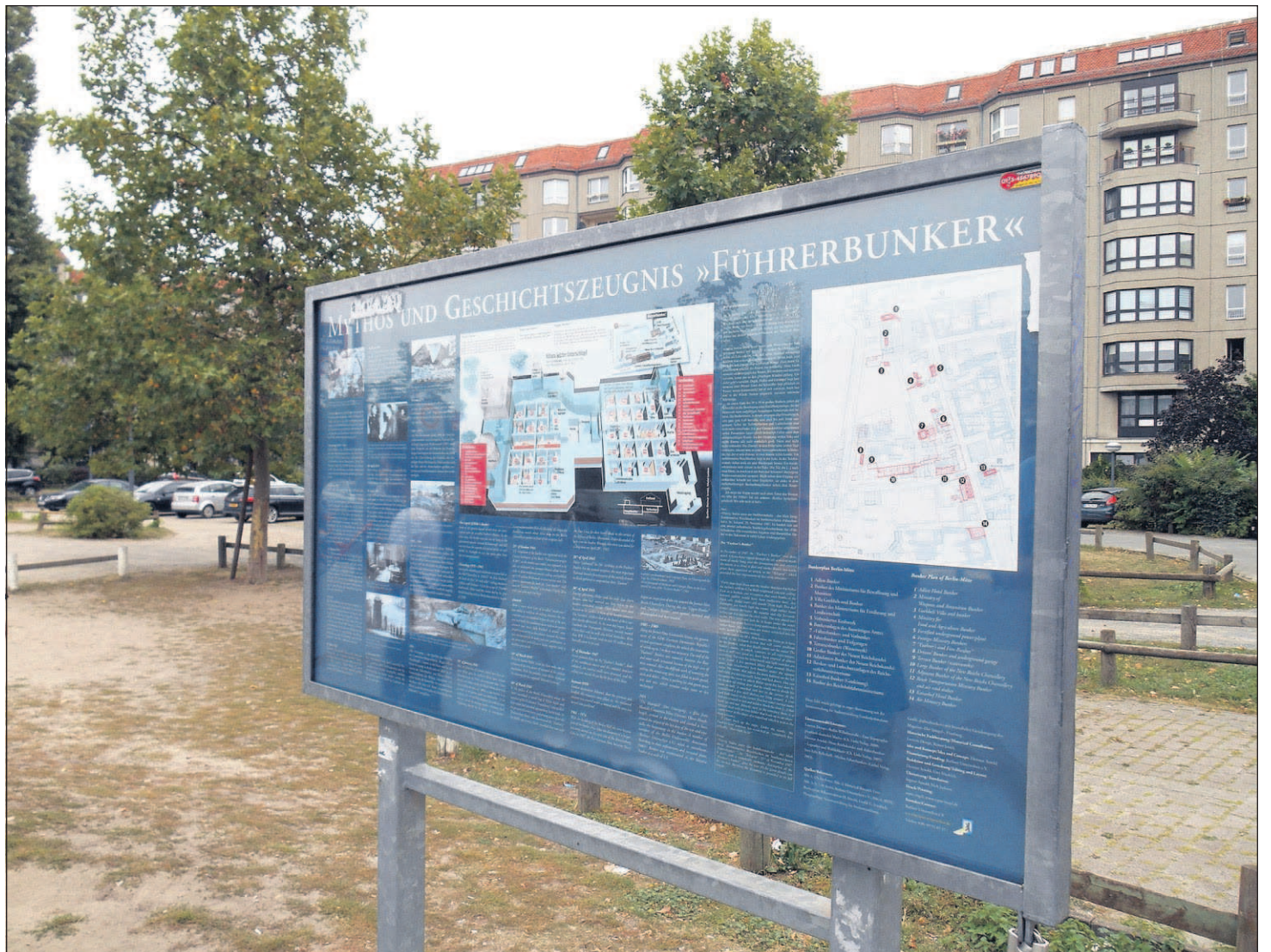
This informational plaque explains Hitler's bunker where he and Eva Braun committed suicide and were incinerated.