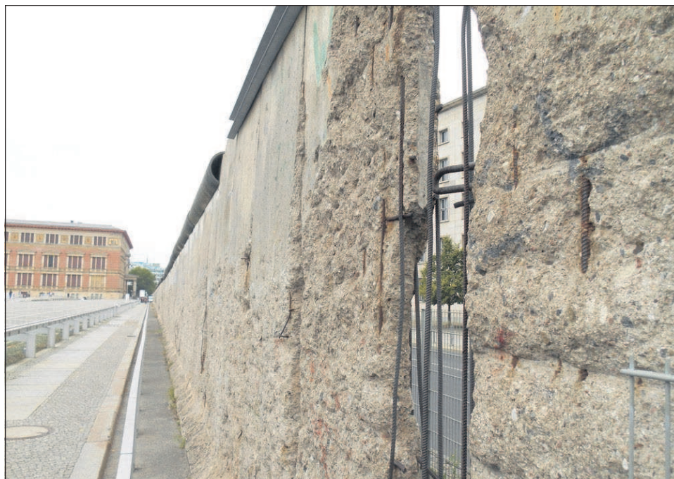
This portion of the Berlin Wall has been preserved against souvenir hunters.