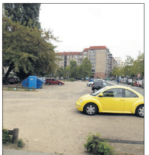
Underneath this parking lot was the Führerbunker, where Adolf Hitler spent his last weeks. Following Hitler's suicide and that of Eva Braun, their bodies were incinerated in this space.

East Germany was 'the most perfected surveillance state of all time.'