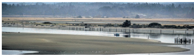
"Bandon Waterfront," a photo by Carol Smith at Tempo Gallery.

Sosaku-Hanga periods. The collection of "wearable art" includes vintage Japanese silk haori, painted silks and handmade flora-dyed silk scarves.