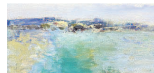
"Across the Columbia" by Renee Rowe at Fairweather's.