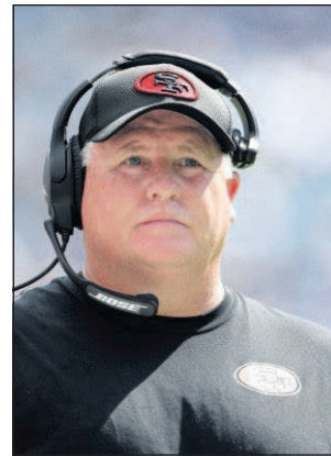
San Francisco 49ers head coach Chip Kelly on the sidelines during the first half of an NFL football game in Charlotte, N.C., earlier this month.

Volleyball — Seaside at Sisters Tournament, TBA Cross Country — Nike Portland Invitational, 9:45 a.m.