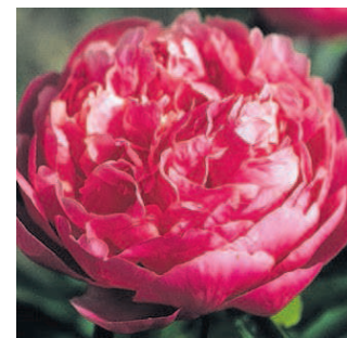
SUBMITTED PHOTO Several varieties of peony roots, such as for this Hawaiian pink coral peony, will be available for purchase in time for fall planting.

For more information, contact Bev Arnoldy at bev_arnoldy@gmail.com