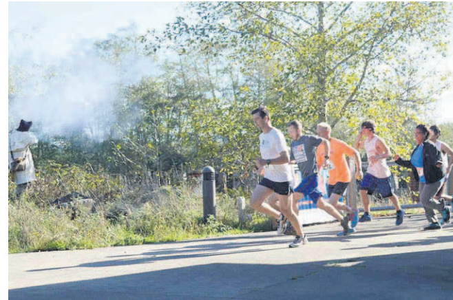
The South Slough Scramble is a 5K run/walk and a 10K run.

For more information, call the park at 503-861-2471, visit www.nps.gov/lewi or find the park on Facebook.