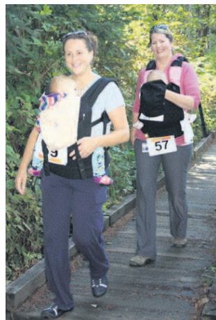
Participants of all ages are invited to take part in the South Slough Scramble.

All 5K and 10K participants will get a finisher's medal. There will also be a safety and health fair along with prize drawings.