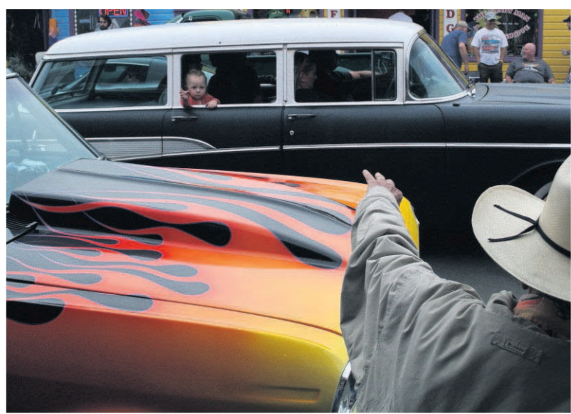
Young and old share a wave amid flames and tall fins during this year's Rod Run.