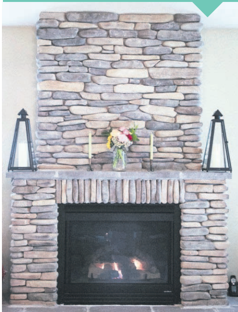
Coast Weekend editor suggested events

1 to 5 p.m., Cannon Beach History Center, 1387 S. Spruce St., Cannon Beach, 503-436-9301, $30. This is a self-guided walking tour of selected homes and gardens. Tour maps will be available 10 minutes prior to the tour.