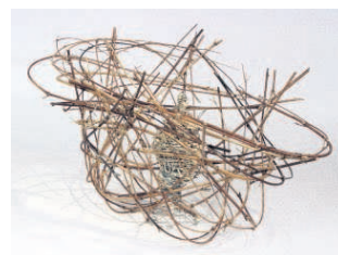
"Last Enslaved Man" by Charles Schweigert at River-Sea Gallery.

shopper in Antwerp, Belgium, the diamond capital of the world.