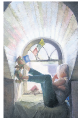
"Contemplation" by Robert Paulmenn at RiverSea.

for an enchanting evening of moon-energized photography. Original photography work will be on display, along with prints and cards available for purchase.