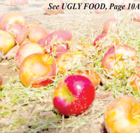
See UGLY FOOD, Page 10A