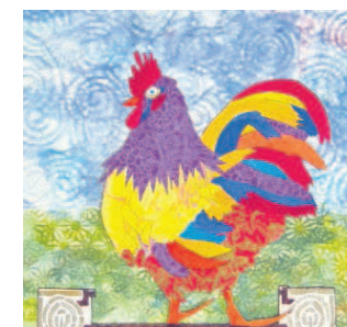
A mixed-media piece by Ellen Zimet.

Sept. 3 through Monday, Sept. 5. Admission and refreshments are free.