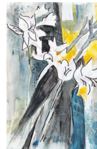
A watercolor by Suzanne King.