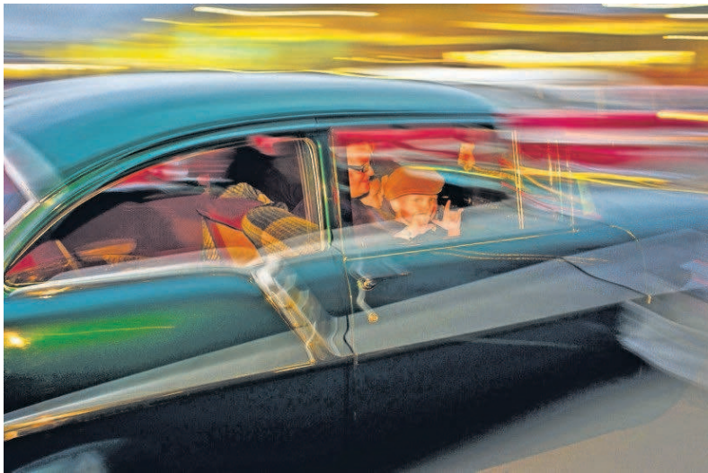
Cruise night is a spectacle of color and motion.