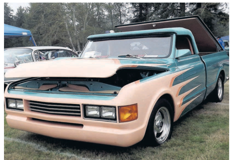
1970 Chevy pickup owned by David Milbourn of Humptulips.