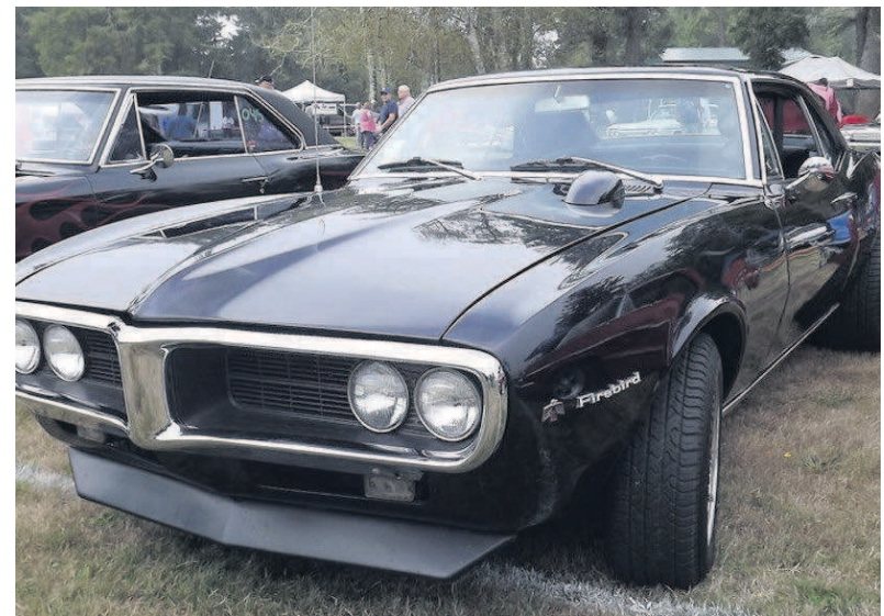
1967 Pontiac Firebird owned by Cheryl Ramberg of Westport, Wash.