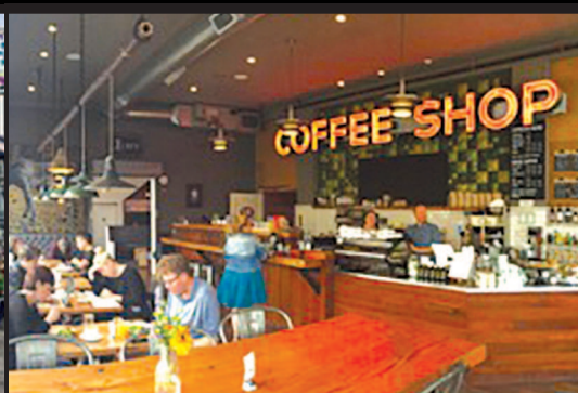
Street 14 Café