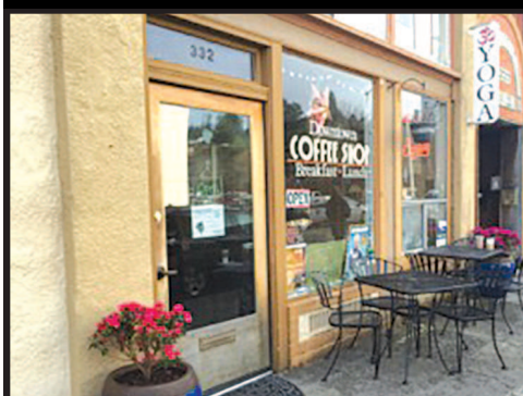
Downtown Coffee Shop