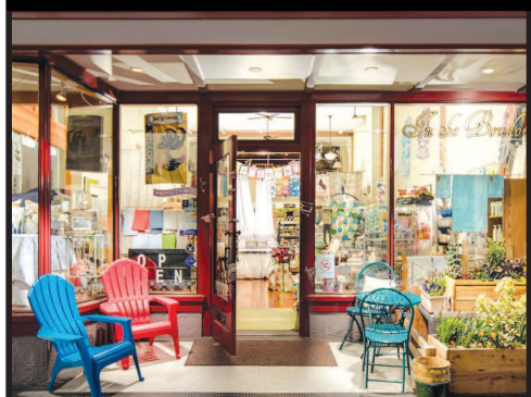
In The Boudoir