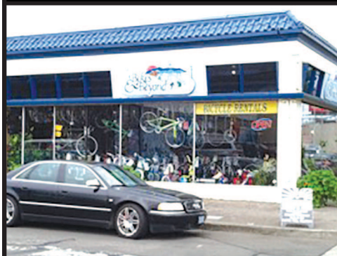
Bikes & Beyond