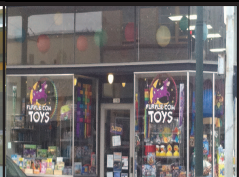
Purple Cow Toys