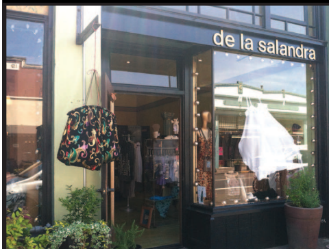
de la Salandra