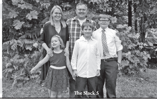
The Slack 5