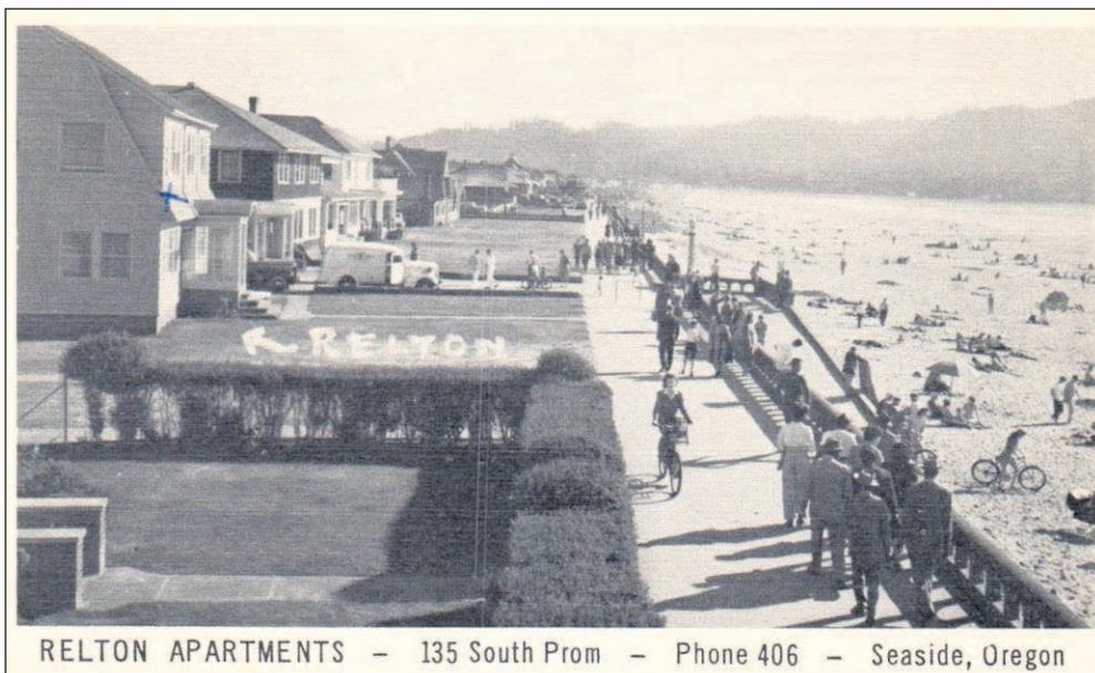
RELTON APARTMENTS - 135 South Prom - Phone 406 - Seaside, Oregon

"In the '70s the Planning Commission changed this area,