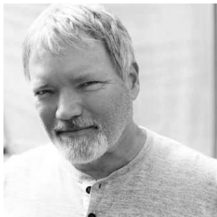
Country musician John Berry will perform.

In 1992, Berry signed his first record deal with Capital Records and quickly became a country radio fan favorite with hits like "Your Love Amazes." "Standing on the Edge of Goodbye" earned Berry a coveted 1995 Grammy nomination. Happily, there were more