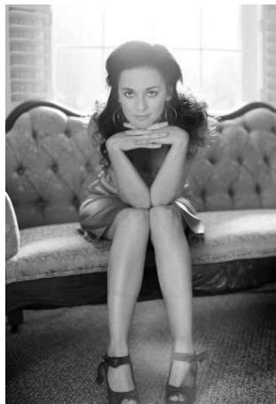
Sherrié Austin has been in the entertainment business since she was a teenager.

In 2003, Berry released his "I Give My Heart" collection and its critically applauded wedding anthem "Will You Marry Me." In 2008, "Those Were the Days," was released, marking Berry's return to mainstream country music. He created his first Christian music album in 2011. In 2012, Berry published the combination book and CD, again titled "Songs and Stories." Over the years, he has continued to tour steadily.