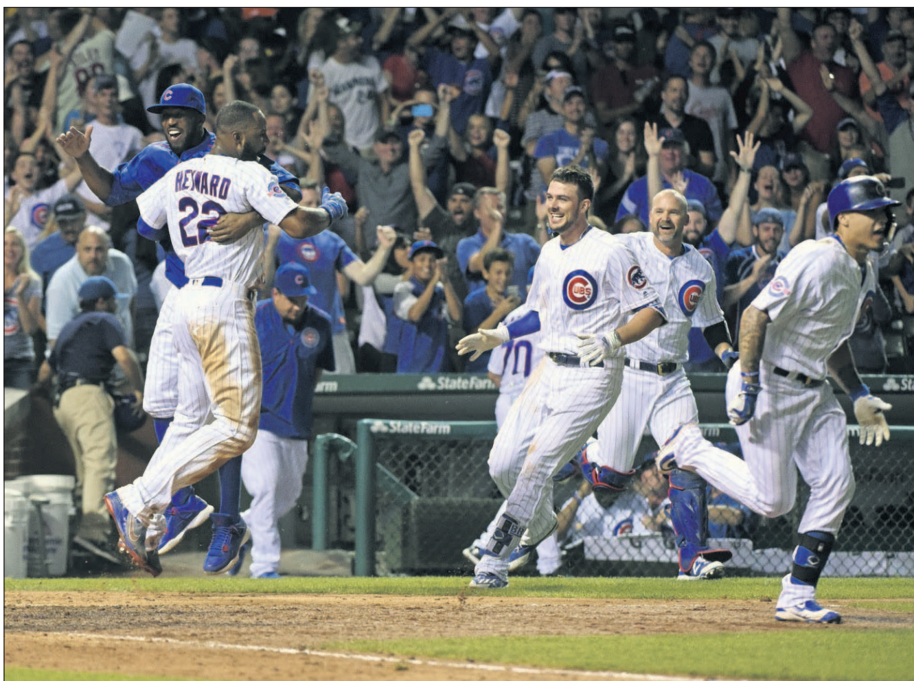
Chicago Cubs Jason Heyward celebrates with teammates after he scored on a sacrifice bunt hit by Jon Lester (34) in the 12th inning of a baseball game against the Seattle Mariners on Sunday, in Chicago. The Chicago Cubs beat the Seattle Mariners 7-6.

"I just kept telling myself, 'Don't be late to square around,'" Lester said. "That's one thing over the last year that I've kind of picked up on