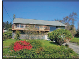
30 Auburn Ave., Astoria $289,000