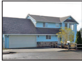
307 W Niagra, Astoria $349,900