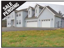
SALE PENDING 90124 Manion Dr, Warrenton $374,900