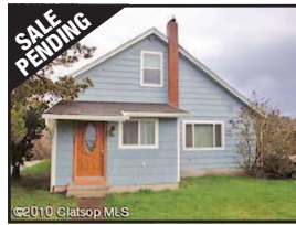
SALE PENDING 33732 Parker Lane, Astoria $249,900