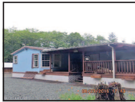
82363 Redbluff Rd, Seaside $129,900