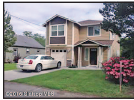
1225 3rd Ave, Hammond $245,000