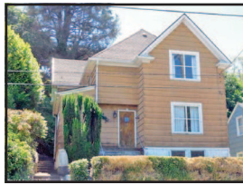
41 W Bond, Astoria $230,000