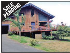
SALE PENDING 36499 Battlecreek Ln, Astoria $375,000