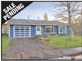
SALE PENDING 564 SW Harbor Pl, Warrenton $136,000