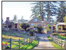
75 SW Juniper, Warrenton $1,099,000