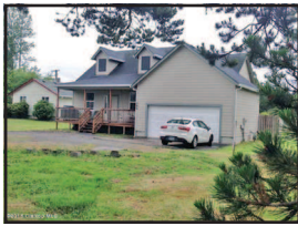
594 NW 9th St, Warrenton $235,000