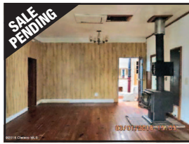
SALE PENDING 1030 3rd Ave., Seaside $89,000