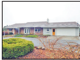
43708 Gerttula Ln, Astoria $389,000