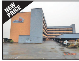
NEW PRICE 1 3rd Street #404, Astoria $279,900