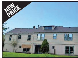
NEW PRICE 91549 Hwy 101, Warrenton $149,900