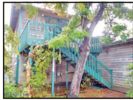
440 Avenue I, Seaside $278,250