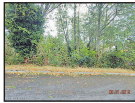
255 Waldorf Circle, Astoria $69,999