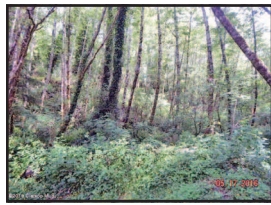
TL3300 James St, Astoria $100,000