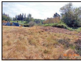
41055 Hillcrest Loop, Astoria $50,000