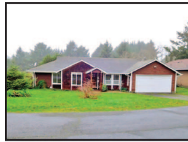
3664 W. Chinook, Cannon Beach $359,900