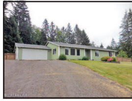
93001 Labeck Rd, Astoria $289,500