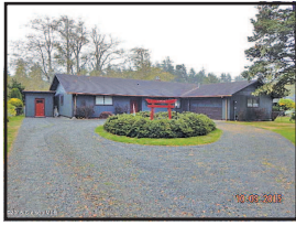
91535 Smith Lake Rd, Warrenton $299,900