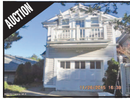
AUCTION 34813 Necarney Blvd, Manzanita $239,900