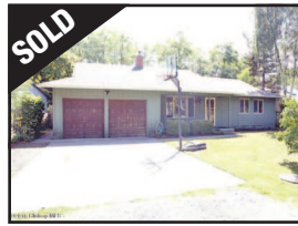
SOLD 33724 Cullaby Lake Ln, Warrenton $255,000