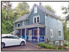
3730 Harrison Ave, Astoria $259,900