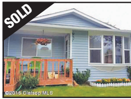
SOLD 1248 7th Ave, Seaside $214,900