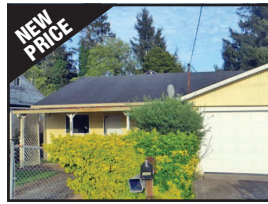
NEW PRICE 1832 8th St., Astoria $154,900