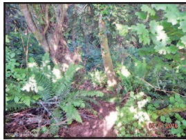
TL03200 Coxcomb Hill Dr, Astoria $125,000