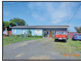
92385 Carnegie Rd, Astoria $120,000