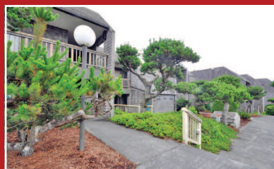
Windward Condo #321, Gearhart • $225,000 Graciously appointed, wood burning fireplace, 2 large rooms with full baths. Steps to the Ocean. MLS#16-995