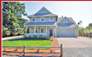
90689 Digger Road, Warrenton • $385,000 Pricing Adjusted Perfect Beach Property. Near the Lewis and Clark Trail at Sunset Beach. Feels Brand new. MLS#16-811