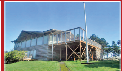
$9120 Manion Drive, Warrenton • $980,000 Lets play tennis, then enjoy the vast ocean view from the new expansive deck at your dream Surf Pines home. VanEvera Baily design and impeccable interior. MLS#16-308