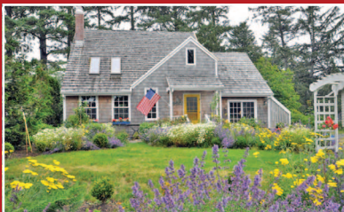
967 N. Cottage Avenue, Gearhart • $415,000 Cheerful Beach Cabin. Updated and spacious. Gracious gardens, within minutes to the beach. Located in the Heart of Gearhart. MLS#16-870