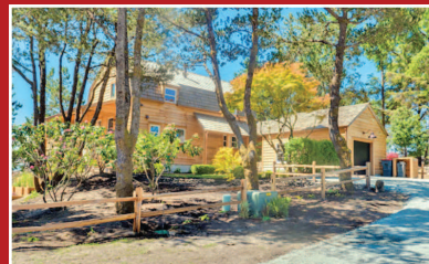
427 H Street, Gearhart • $799,000 Location, Location, Location. This thoughtfully placed home is surrounded by the sound of the ocean and little beach Gearhart. Tastefully remodeled with hardwood floors. MLS#16-571