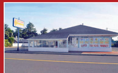
250 Avenue U, Seaside • $695,000 Seaside Cove Area; Put your dreaming hat on and imagine an opportunity to own this spacious store with road frontage. It could be whatever you want it to be, all you have to do is dream. MLS#16-782