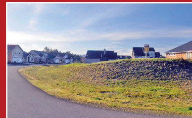
Lot 130 The Reserve, Gearhart • $97,500 Outstanding Lot in the popular Gearhart Reserve. Great location for your dream home. Great price and good value. MLS#16-376