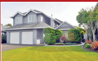
321 Avenue U, Seaside • $367,000 The cove at Seaside, perfect location for your beach house desires. Park your car, Enjoy a bon-fire on the beach then walk home. It doesn't get any better than this location. MLS#16-781