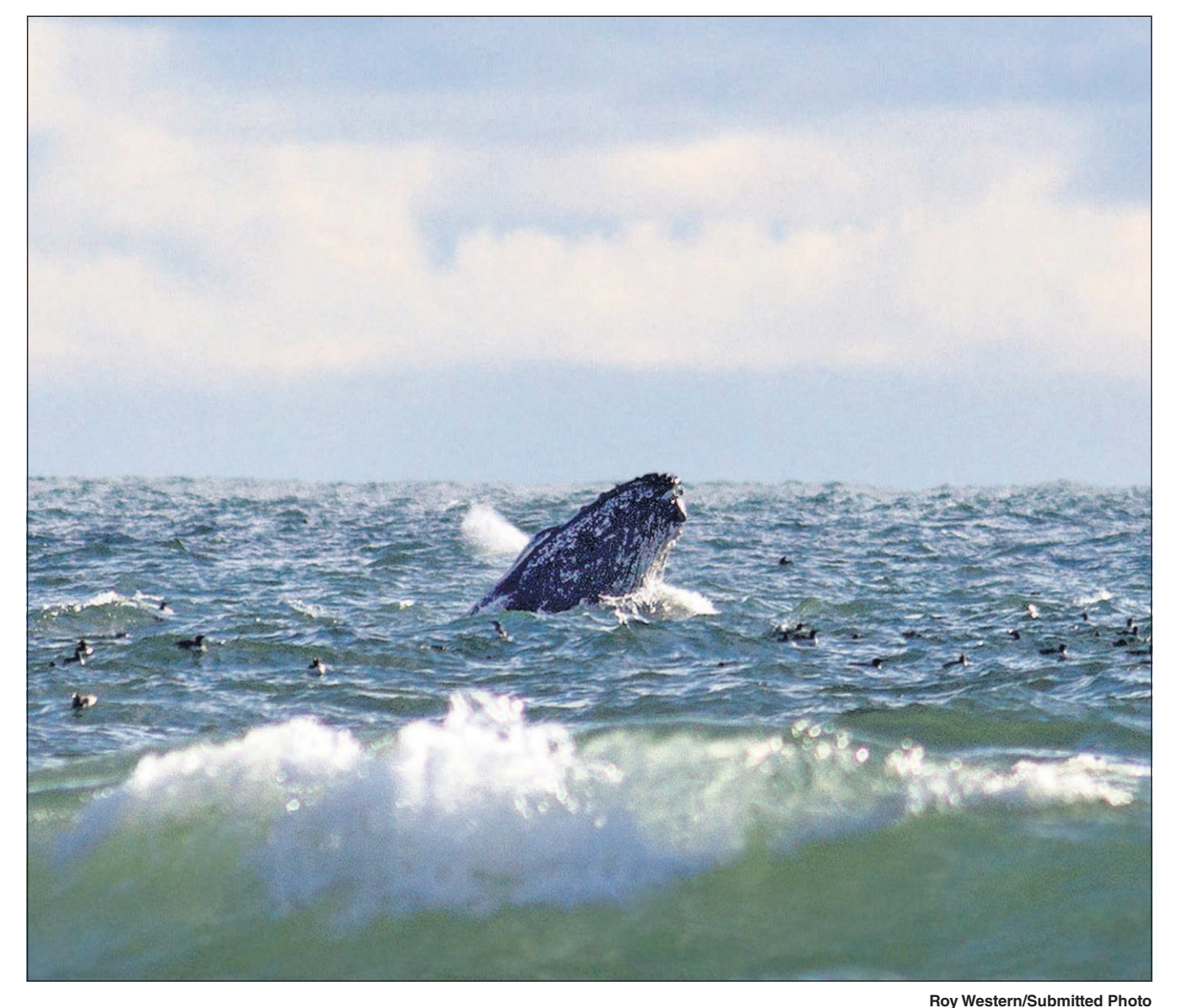
A mature humpback whale breached and spouted off Klipsan Beach in Washington state on July 22. The whale and the seabirds clustered all around would have been feeding on small bait fish schooling just beyond the breakers. Humpbacks ranging up to 60 feet long have been a welcome sight in the waters of Pacific and Clatsop counties this summer.