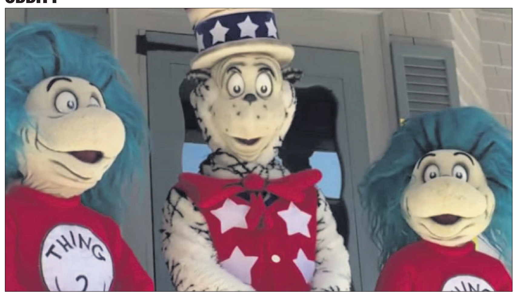
The Cat in the Hat is running for president — and helping Random House sell a bunch of books.