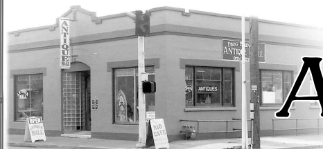
Phog Bounder's Antique Mall, present day

For Tom and Debbie, it is the perfect building and location for their business. The ambiance and historic feel enhances the merchandise their 50+ vendors supply for sale within both floors of the building.