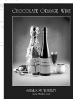
Chocolate Orange Wine

(503) 325-5978 • Web page: www.shallon.com E-mail: paul@shallon.com