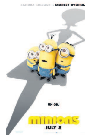
"Minions" will screen Aug. 17.

animal metropolis, Judy Hopps, voiced by Jennifer Goodwin, becomes the first rabbit to join the police force, and she learns how tough it is to enforce