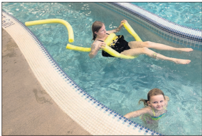
Children and adults enjoy the Lazy River portion of the main pool at the Astoria Aquatic Center Monday.