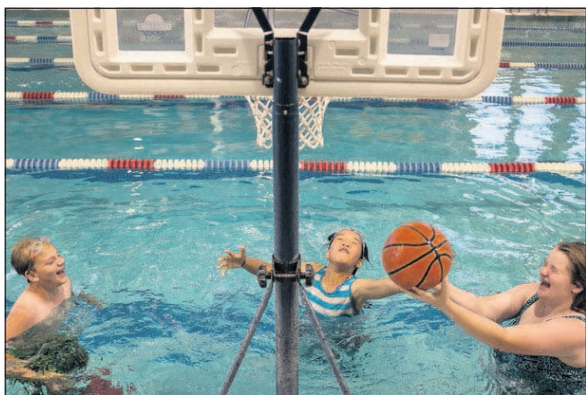
While waiting for the swimming lesson to start, children play with the Astoria Aquatic Center's basketball hoop Monday afternoon.