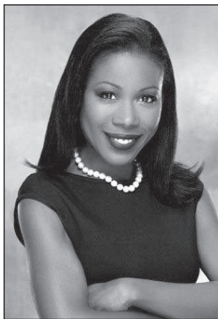
Isabel Wilkerson won a Pulitzer Prize in 1994.

Wilkerson spent 15 years researching "The Warmth of Other Suns," interviewing more than 1,200 people to tell the story of the nearly six million African Americans who, between 1915 and 1970,