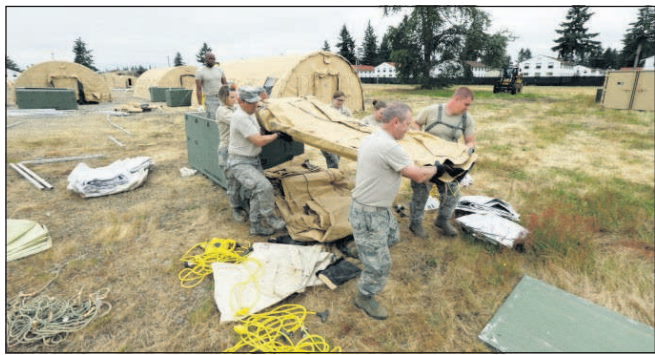
Washington Air National Guard soldiers from Fairchild Air Force Base in Spokane, Wash., work to assemble temporary living structures at Joint Base Lewis-McChord in Washington in May.

“Would you buy a lottery ticket if you had a 40 percent