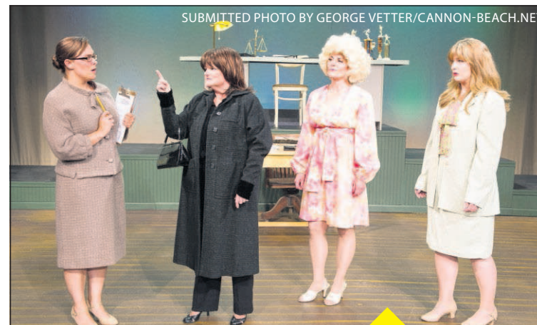
"9 to 5: The Musical" 7:30 p.m., Coaster Theatre, 108 N. Hemlock St., Cannon Beach, 503-436-1242, $18-23. "9 to 5: The Musical" is a story of friendship between three co-workers and their plot for revenge against their chauvinist boss.

7 p.m., Barn Community Playhouse, 1204 Ivy Ave., Tillamook, 503-842-7940, $10-15. This comedy revolves around the relationships of three middle-aged single siblings, who squabble about their lives and loves.