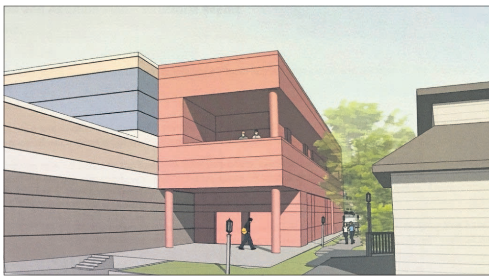
Steele Architects rendering of the Seaside Civic and Convention Center's southeast corner.

With a land gift of 80 acres from Weyerhaeuser Co., the school district is planning a bond referendum to create a new high school campus east of South Wahanna Road in Seaside. While a previous bond