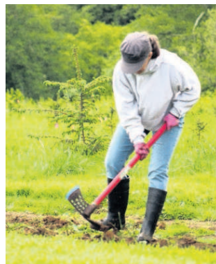
Volunteers can help out at Circle Creek Habitat Reserve.

Why join NCLC for these projects? For fun — and also to help take care of NCLC lands and to assist the stewardship team in its duties. The crew is looking forward to connecting more with the community through W 3 ,