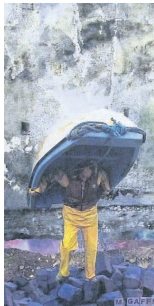
A collage by Mary Gaffney at Luminari Arts.

1001 Commercial St. In honor of Astoria Pride, Sea Gypsy Gifts will show off its whimsical side. With mermaid costumes, handmade crystal wire wrap crowns, new funky jewelry, scarves, purses and more. See new artwork. All costumes and jewelry on sale.