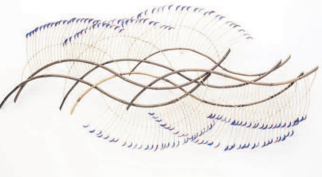
"Okeanos," a black bamboo, fused glass and waxed linen thread sculpture by Charissa Brock at RiverSea Gallery.