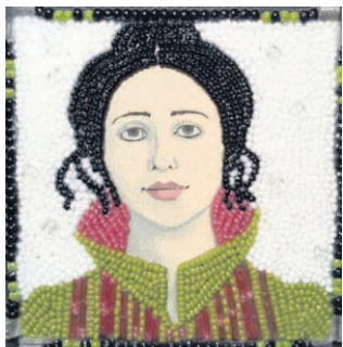
A portrait by Zemula Fleming at Forsythea.