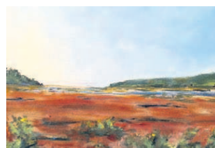
"Makah Wetlands" by Thron Riggs at Tempo Gallery.