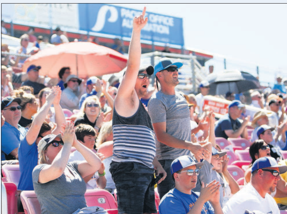
Knappa fans cheer after a play.