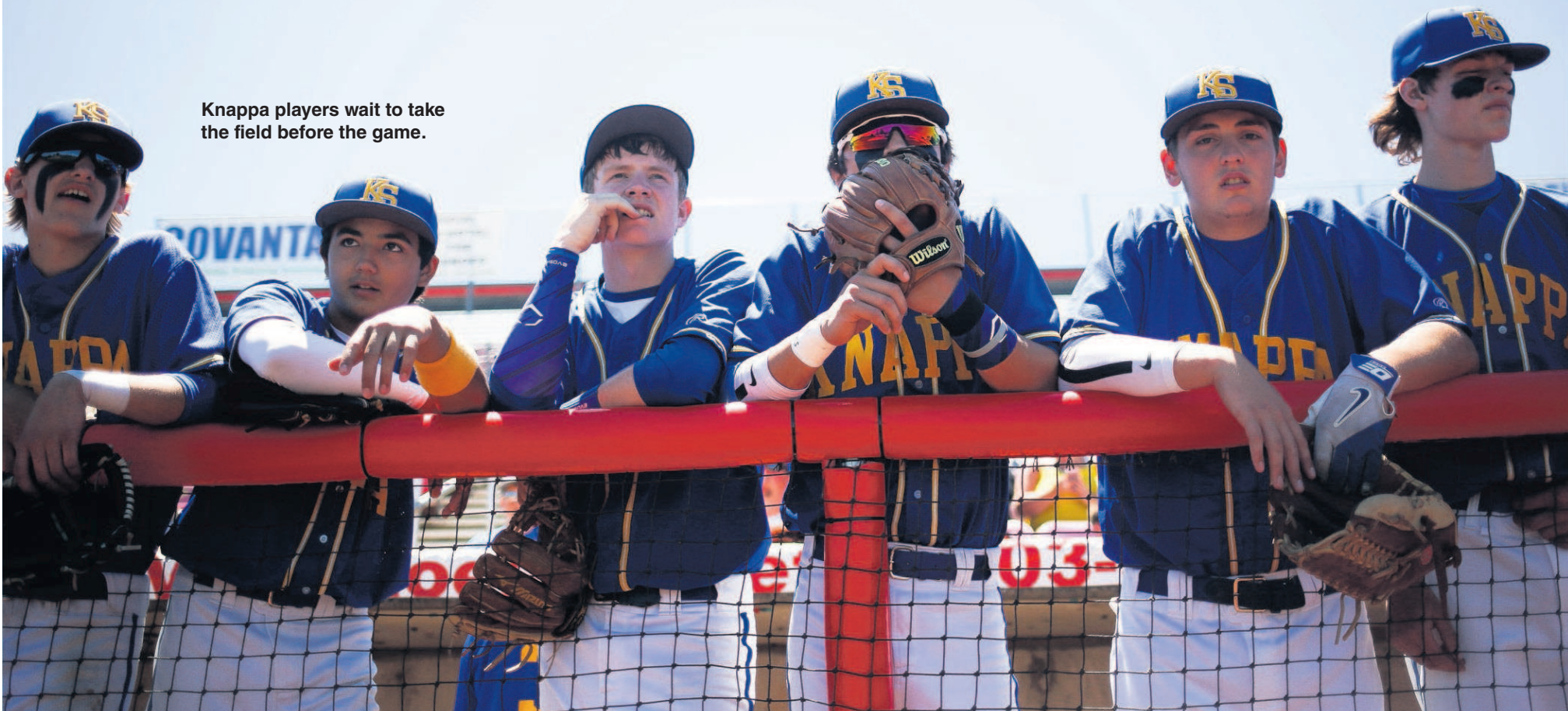
Knappa players wait to take the field before the game.

Burns finishes 25-5, and ends the season on a 20-game win streak.