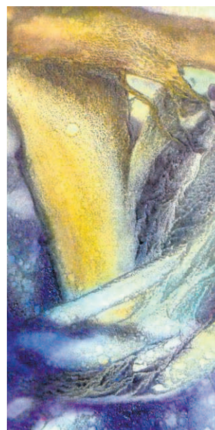
A work by Jeffery Hall at Beach Books.