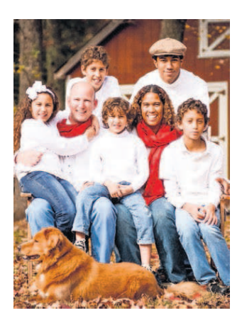
A photograph