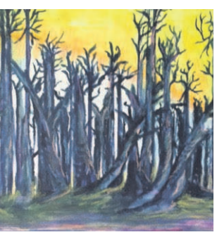
"After the Fire," a watercolor by Jane Means at Trail's End.

726 Pacific Way Pacific Crest Cottage will feature