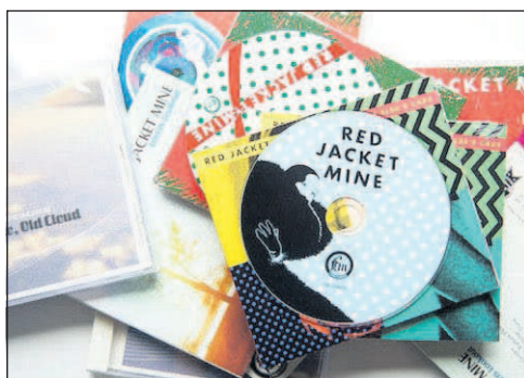
Red Jacket Mine