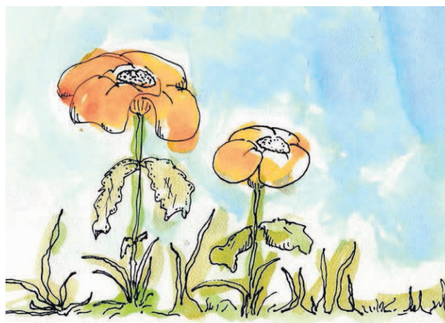
A painting by Jim Zaleski at Beach Books.

INFO 503.861.9875 highlife-adventures.com