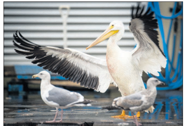
A pelican flaps its wings outside of Borenstein Seafoods as crews unload a fishing vessel.