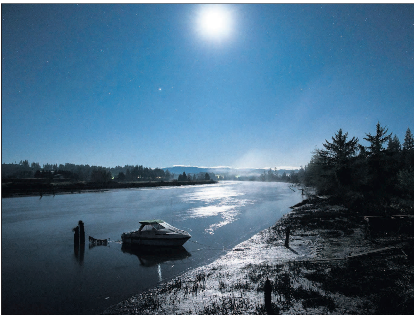
Midnight on the Wallooskee River.