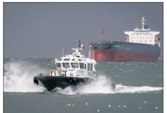
The Connor Foss rides through the choppy waters of the Columbia River.