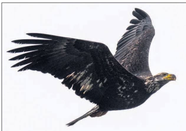
A juvenile bald eagle flies near Pier 1.