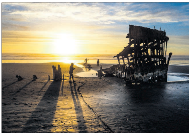
People walk along the beach near the Peter Iredale shipwreck at sunset.