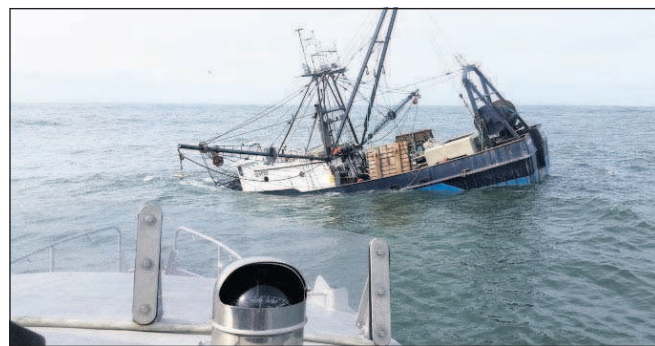
The 74-foot fishing vessel Privateer sank approximately 1 mile north of Grays Harbor, Washington, Friday.

"It was clear the fishing crew had conducted drills and were prepared for an emergency," Petty Officer 2nd Class