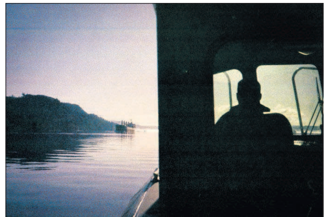
The Columbia River