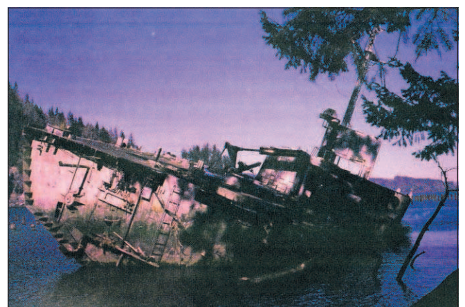
A derelict ship near Dismal Nitch in Washington