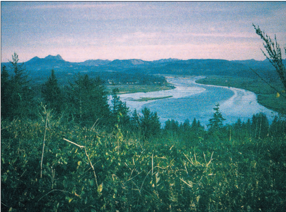
The Youngs River and Saddle Mountain