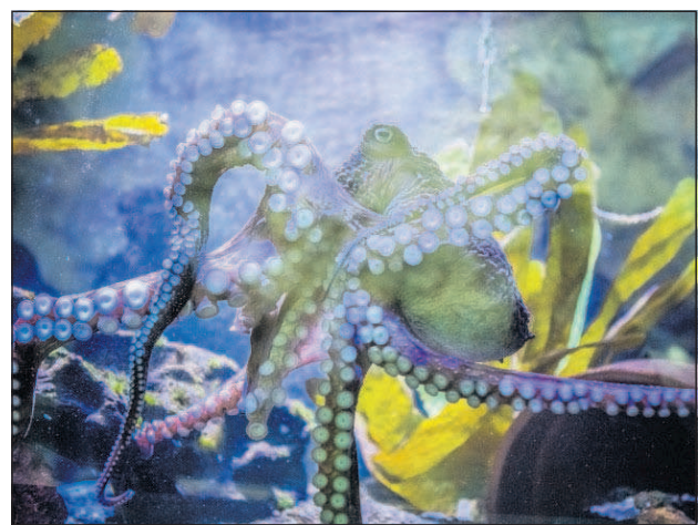
The National Aquarium of New Zealand Inky the octopus swims in a tank at the National Aquarium of New Zealand in Napier, New Zealand. Inky the octopus escaped the aquarium for the Pacific Ocean.

"'Goonies,' I don't know if I ever saw it," Zalutsky admitted. "But wherever you point the camera it's going to be an interesting view. So you can't lose."