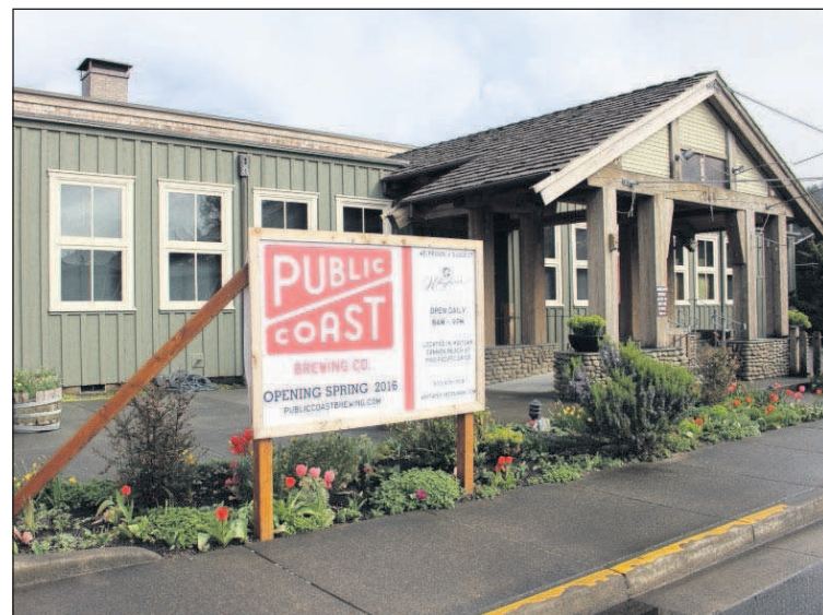
Lyra Fontaine/EO Media Group