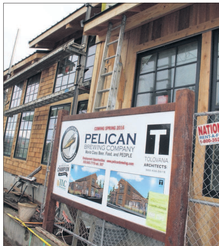
Lyra Fontaine/EO Media Group