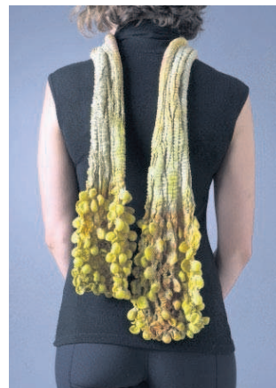
A scarf by Mihara Shibori Studio, which will show work at Astoria Fiber Arts Studio during art walk.